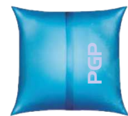
CSPP 500 ml